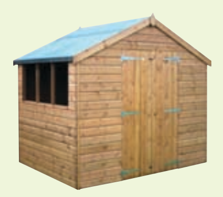
1.8 x 2.4 (6' x 8') Double Door Apex Style B

Top quality t&g shiplap sheds in Apex and Pent roof styles. Buildings are light and airy with plenty of windows and generous headroom. Doors have 3 hinges and key locking. With 22 sizes and 6 window options to choose from there's bound to be a Premier Range Shed to suit your garden.