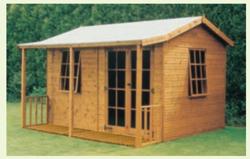
3.6 x 2.4 (12' x 8') Garden Room with verandah