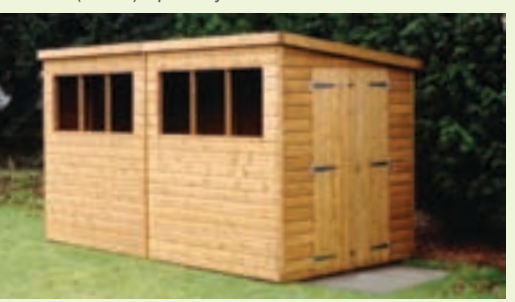
3.6 x 1.8 (12' x 6') Pent Style E with optional double doors