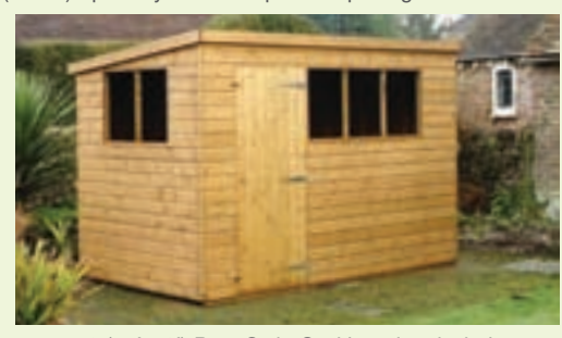
3.0 x 1.8 (10' x 6') Pent Style C with optional windows in second elevation