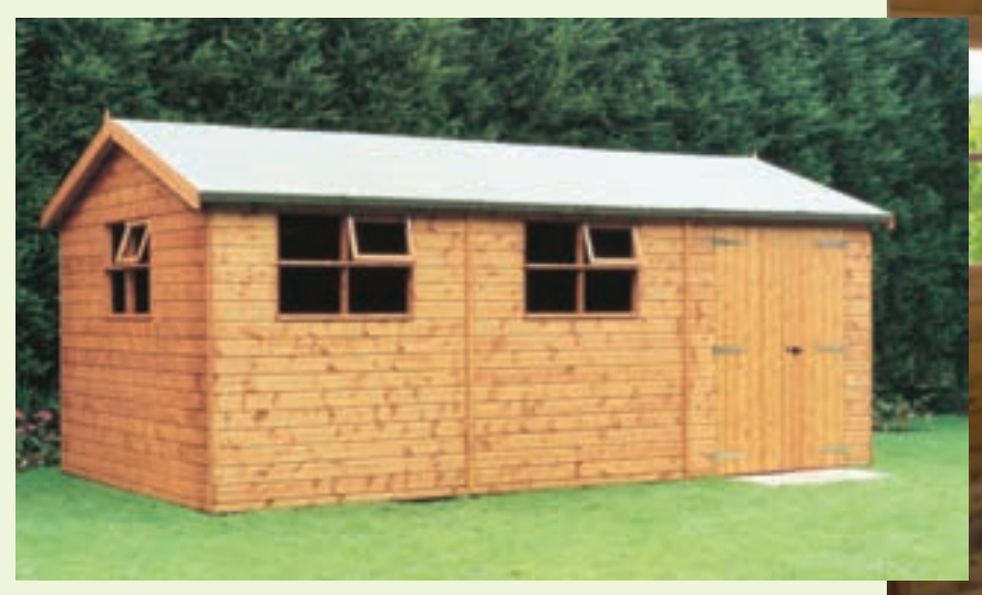
5.4 x 3.0 (18' x 10') Apex Workshop