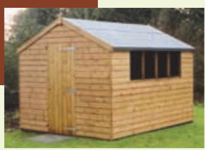
3.0 x 2.4 (10' x 8') Apex Style A