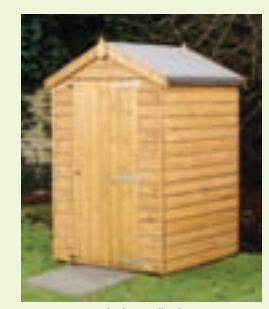
1.2 x 1.2 (4' x 4') Apex