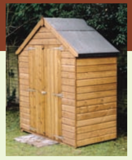
0.9 x 1.8 Apex Garden Tidy