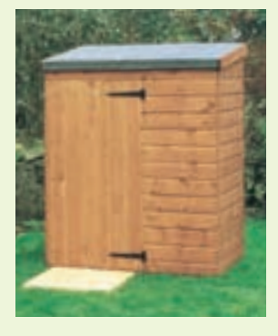
0.6 x 1.2 Pent Garden Tidy

Apex Garden Tidy Single Door 0.9 x 1.2 (3' x 4') Double Door 0.9 x 1.8 (3' x 6')