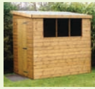
2.1 x 1.5 (7' x 5') Pent Style F