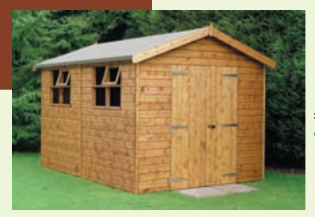
3.6 x 2.4 (12' x 8') Apex Workshop

21 standard sizes from: 2.4m x 2.4m to 9.0m x 3.6m (8' x 8' to 30' x 12')