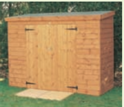
Double Door 0.9 x 1.8 (3' x 6') 0.9 x 2.4 (3' x 8')