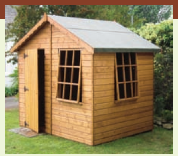
1.8 x 2.4 (6' x 8') Garden Lodge with optional extra window